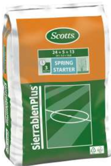
New packaging 2013