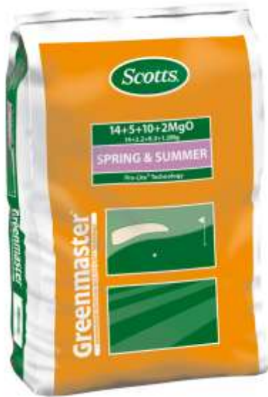
New packaging 2013

Spring & Summer 14-5-10+2MgO 14+2.2+8.3+1.2Mg