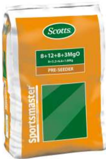
New packaging 2013