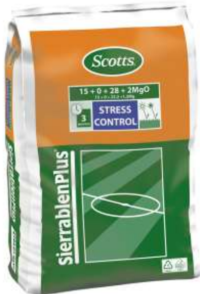
New packaging 2013

Stress Control 15-5-22+2MgO 15+2.2+18.3+1.2Mg