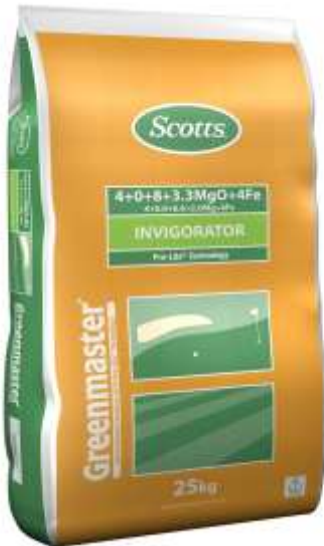
New packaging 2013